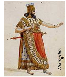
Costume sketch - Nabucco - original production